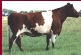
NPS Irish Rose 542

2003 Great Shorthorn Revival - Lot 11 Consigned by Du-Lyn Farm, this donor was purchased by Royal Tartan Group for $5,800. In the Spring 2004 Cagwin Farms Sale, a featured flush brought $5,000!