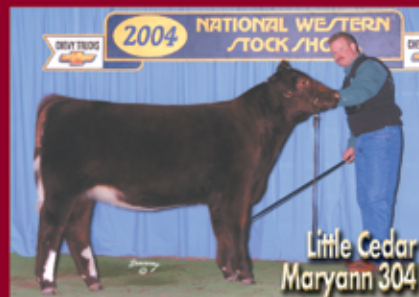
Little Cedar Maryann 304

2003 Great Shorthorn Revival - Lot 15 Consigned by Schrag Shorthorn Farms Hoffman-Bennett-Stull Farms purchased 2/3 interest for $2,800. In 2004, they sold 800 units of semen totaling $16,000. What a return!