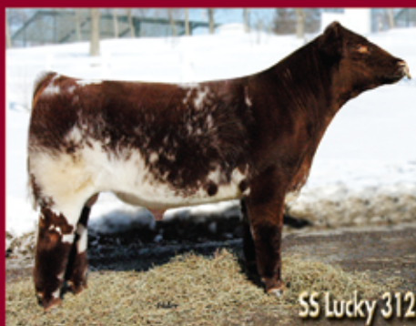
SS Lucky 312

2003 Great Shorthorn Revival - Lot 30 Consigned by Grathwohl Cattle Co. A very popular second place class winner at the 2003 NAILE for Little Cedar Cattle Co.