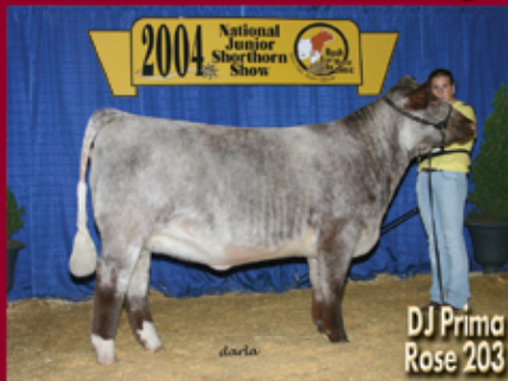
DJ Prima Rose 203