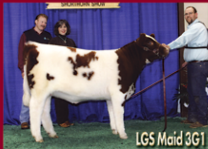
LGS Maid 3G1